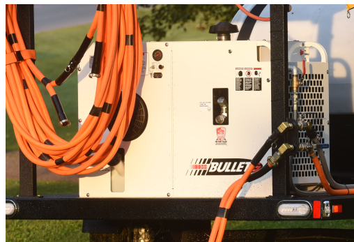
Kohler driven rotary screw compressor