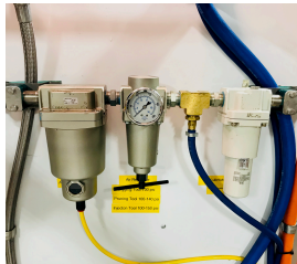
Self Draining Filter. Regulator & Lubricator