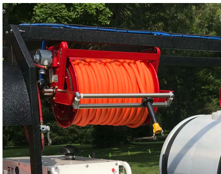
Pneumatic Rewind 300' drench reel

Specifications subject to change without notice.