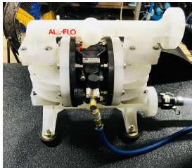
1" Pump For Injecting