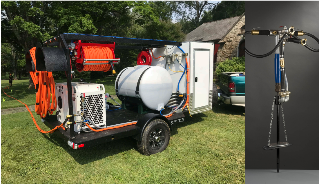
Model ATT-RS-5500 with Fracture/Injection Tool.

Designed specifically to fracture and feed the soil surrounding trees without harming the root system.